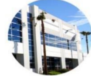
CORPORATE & COMMERCIAL BUILDINGS