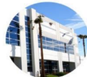
CORPORATE & COMMERCIAL BUILDINGS